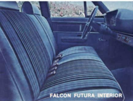
FALCON FUTURA INTERIOR

Economize without giving up a thing in a new 1970 Falcon. Spacious inside, compact outside, Falcon combines big-car ride with easy, small-car handling. Performance is snappy and eager. Gas mileage, something to write home about. The Futura Club Coupe and 4-Door Sedan are the last word in compact luxury and big-car ideas. The Falcon 4-Door Sedan and Club Coupe are downright king-sized when it comes to savings. Falcon and Futura Wagons tote almost as much as any full-sized wagon (85.2 cu. ft.). And every Falcon model is built to the rigid quality standards of the higher priced Fords. Standard Falcon features include: 111-inch wheelbase (113" on wagons); Ford's big 200-cu. in. Six; fully synchronized manual 3-speed transmission; and Ford's Lifeguard Design Safety Features. Options include: 302 V-8; SelectShift; Select-Aire Conditioner; Power Steering; AM Radio, and many more.