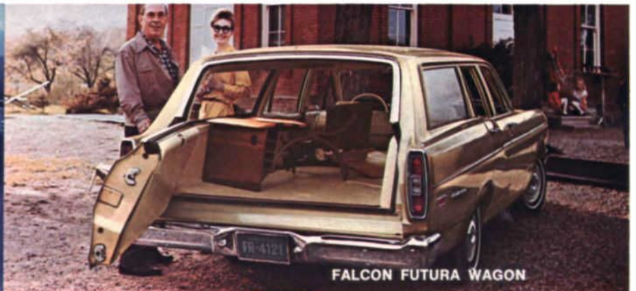
FALCON FUTURA WAGON