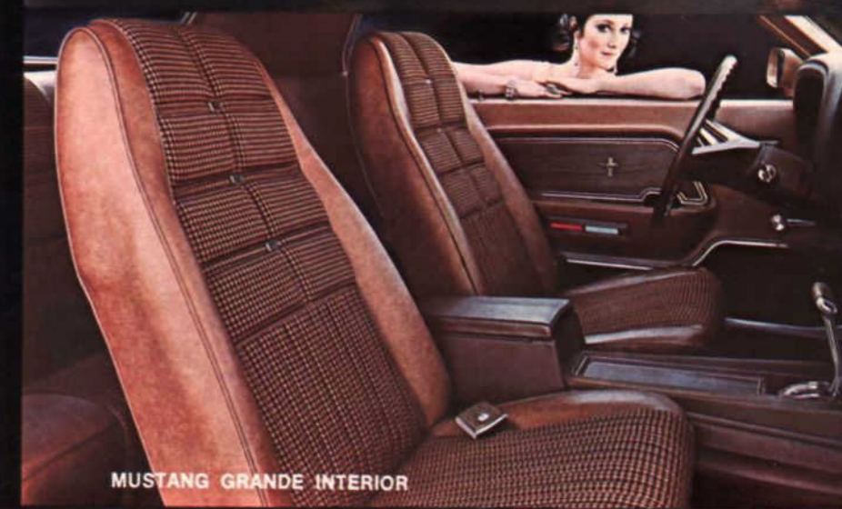
MUSTANG GRANDE INTERIOR