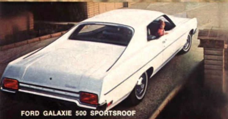
FORD GALAXIE 500 SPORTSROOF