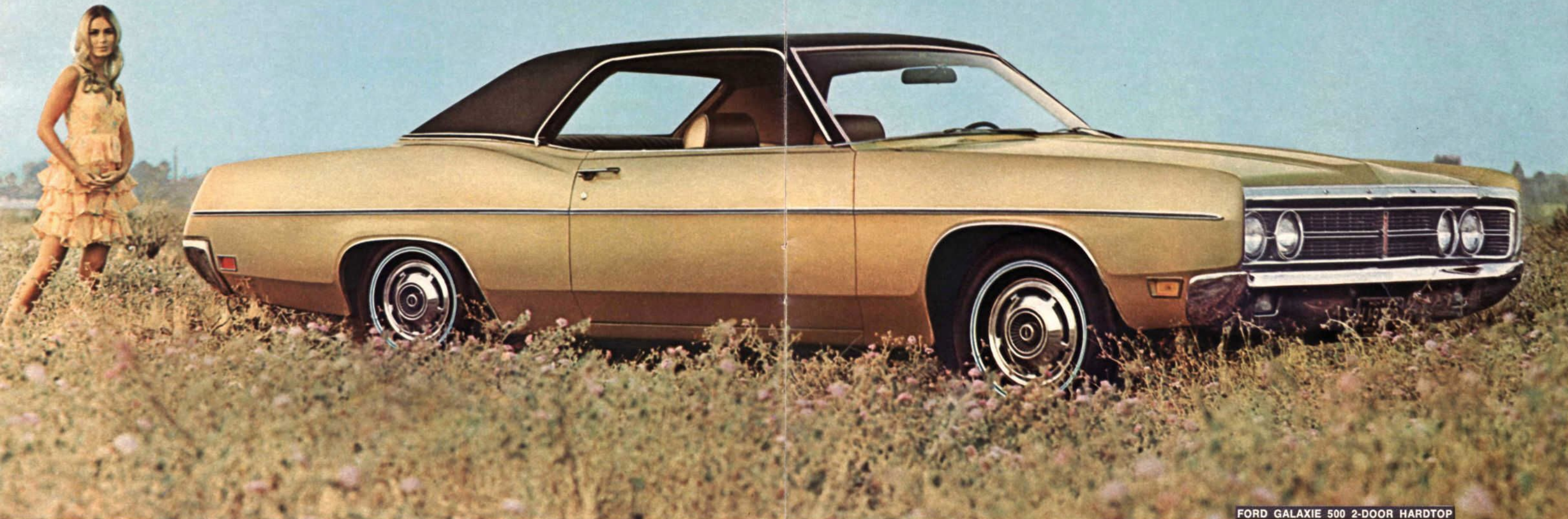
FORD GALAXIE 500 2-DOOR HARDTOP