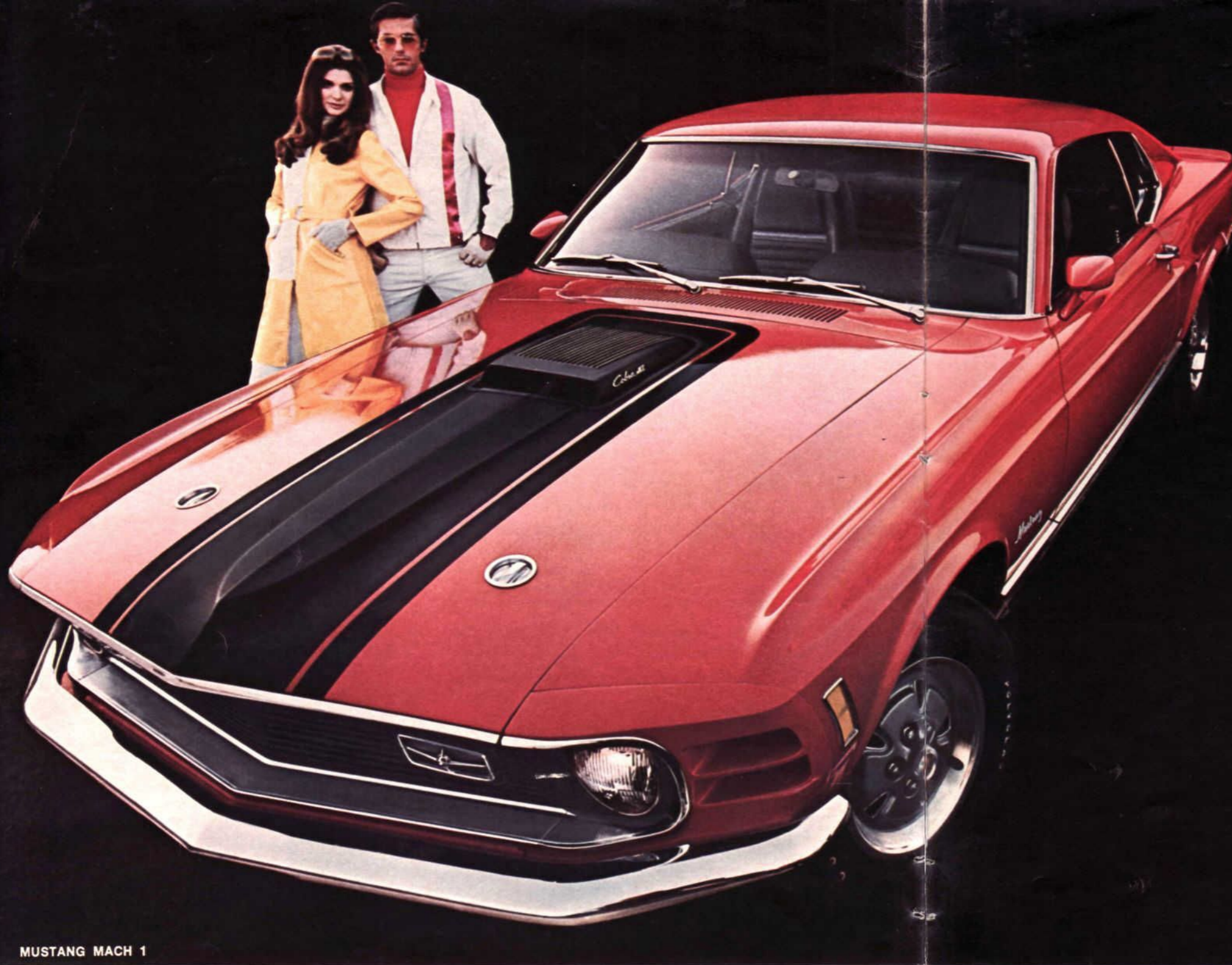
MUSTANG MACH 1