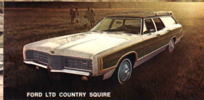
FORD LTD COUNTRY SQUIRE