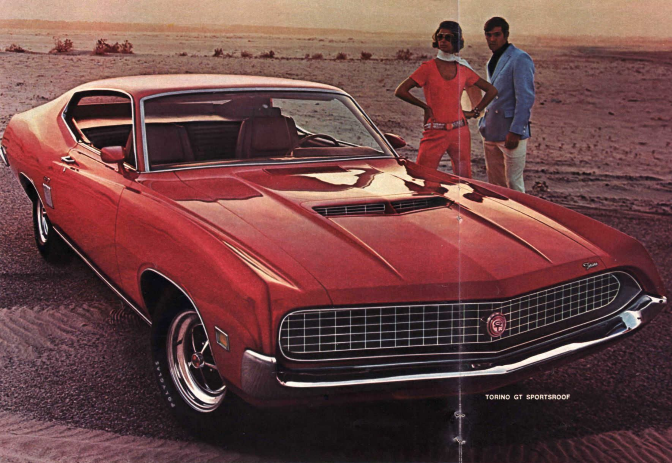
TORINO GT SPORTSROOF