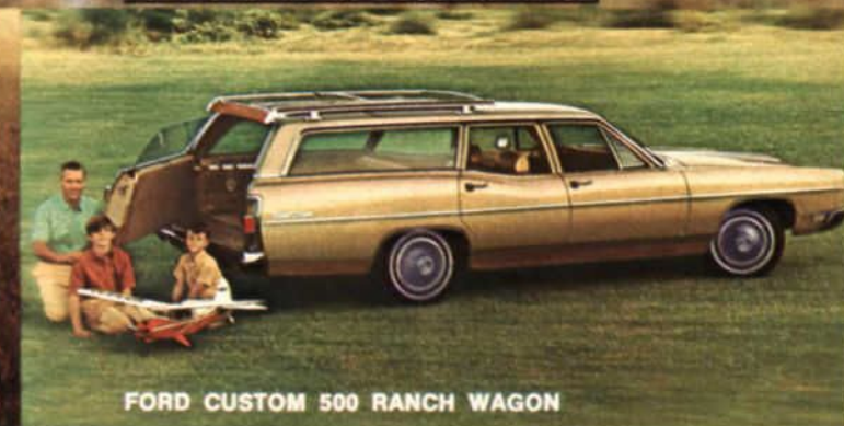
FORD CUSTOM 500 RANCH WAGON