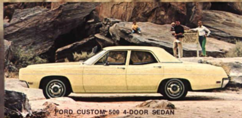
FORD CUSTOM 500 4-DOOR SEDAN