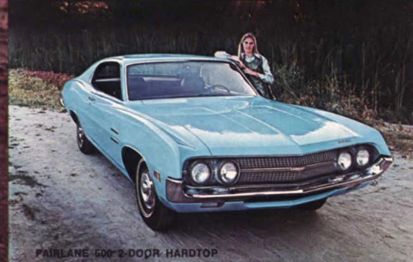
FAIRLANE 500 2-DOOR HARDTOP