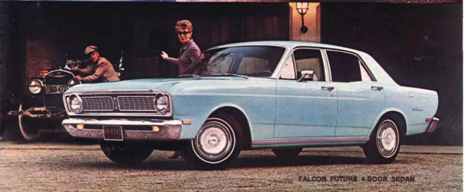
FALCON FUTURA 4-DOOR SEDAN